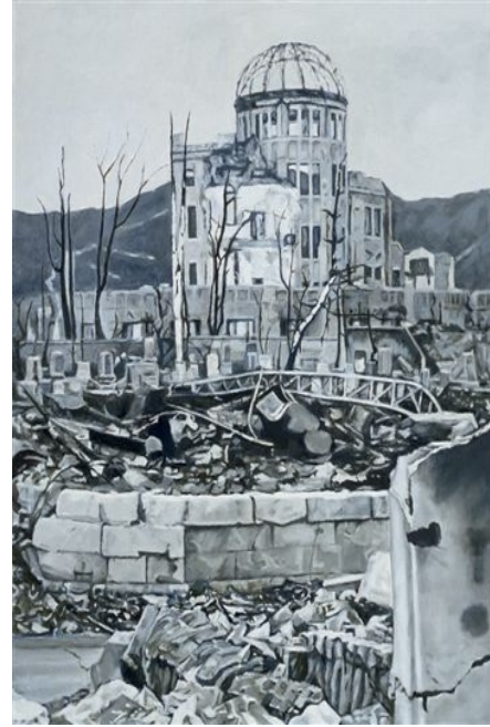
Painting by Toki Ori